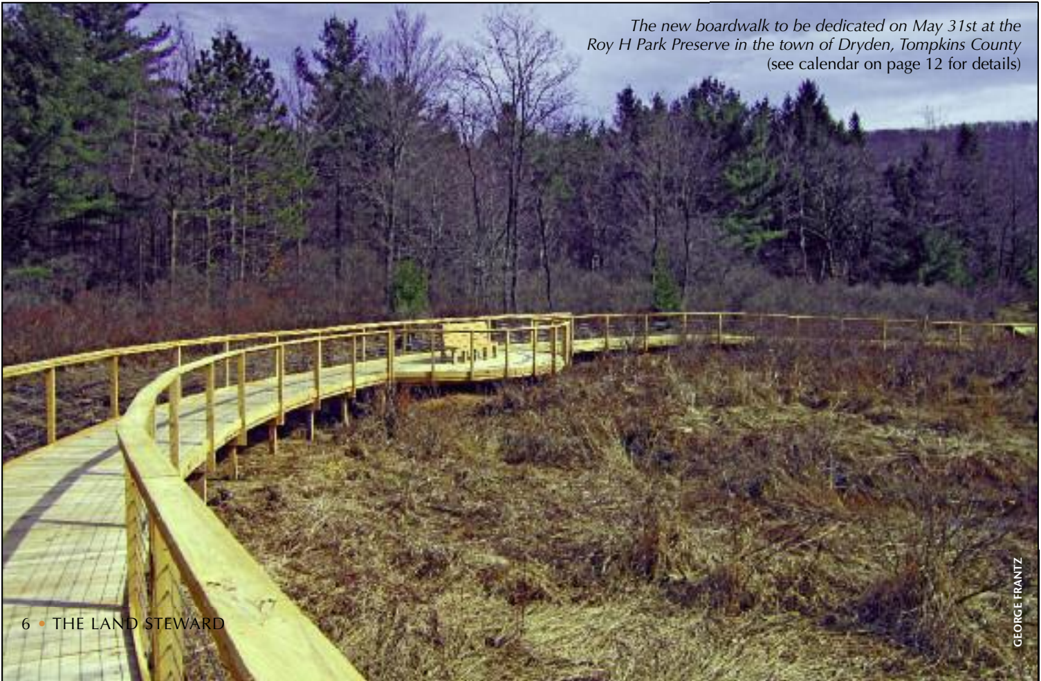
The new boardwalk to be dedicated on May 31st at the Roy H Park Preserve in the town of Dryden, Tompkins County (see calendar on page 12 for details)