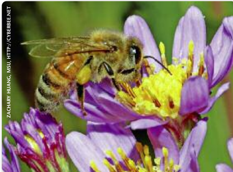
A worker honey bee engages in collecting pollen and nectar. The pollen that she has collected is visible as the yellow pellet on her hind leg facing the camera.