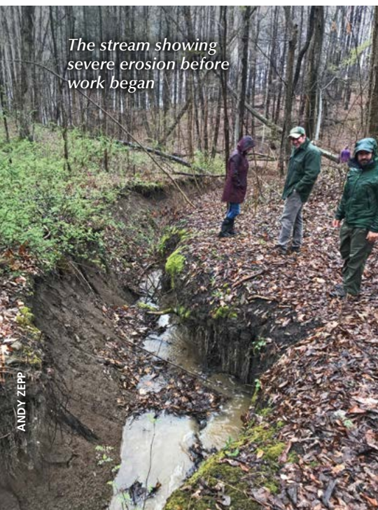
The stream showing severe erosion before work began

The public is welcome to view the restoration site, but visitors are asked to stay on marked trails to minimize disturbance to the area. Directions and additional preserve information can be found at fllt.org/vanriper .