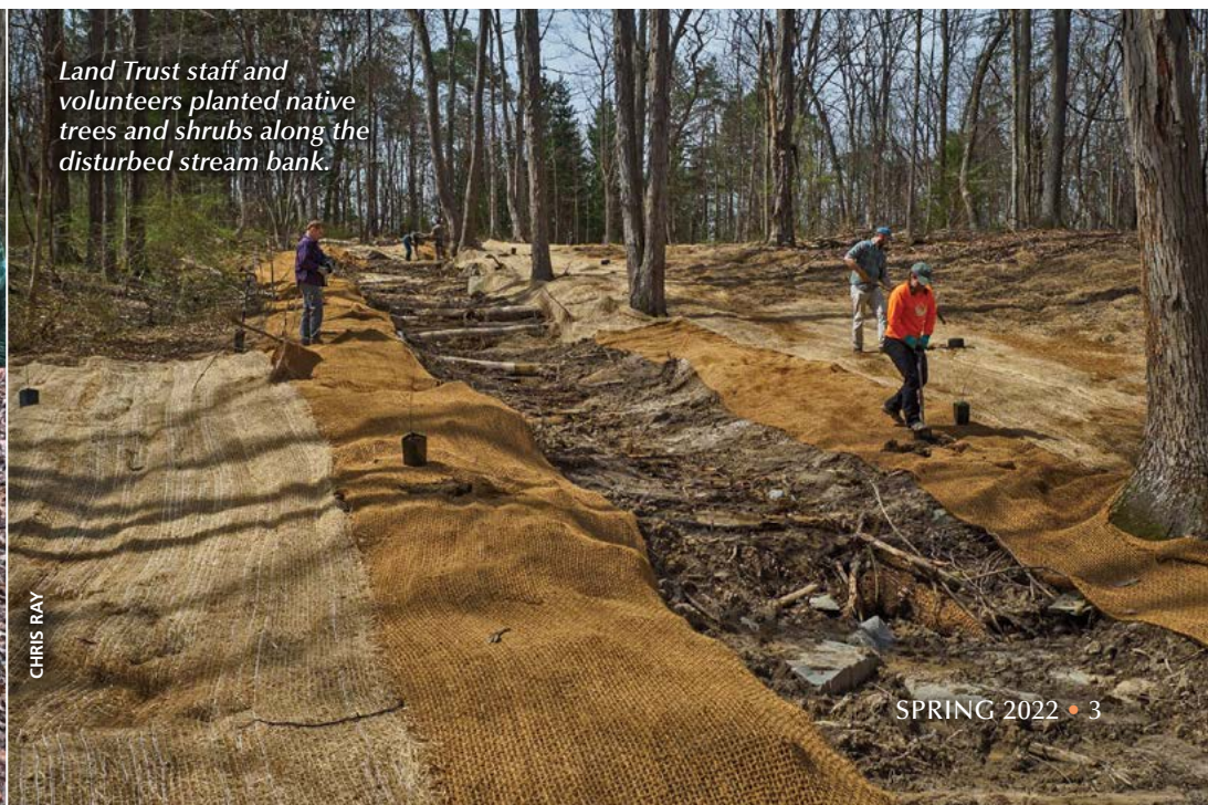
Land Trust staff and volunteers planted native trees and shrubs along the disturbed stream bank.