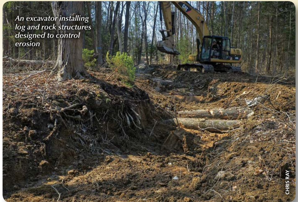
An excavator installing log and rock structures designed to control erosion

More than 600 feet of stream corridor was restored by first raising the level of the stream bed and then installing step pools that serve to dissipate the stream's energy, reducing erosion. After completing the work,