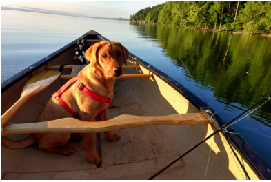
TOXIC ALGAE – FACTS FOR EVERYONE TO KNOW

TOXIC ALGAE OUTBREAKS – or harmful algal blooms (HABs) – within each of the Finger Lakes have generated alarming headlines over the last few years. Their persistence is motivating FLLT to take immediate action to protect our waters. Please visit FLLT.ORG/WATER to find the following pages and more: