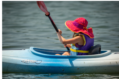
OUR PARTNERS IN FINGER LAKES WATER QUALITY PROTECTION