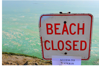
TOXIC ALGAE – OUTBREAK RESOURCES & NEWS