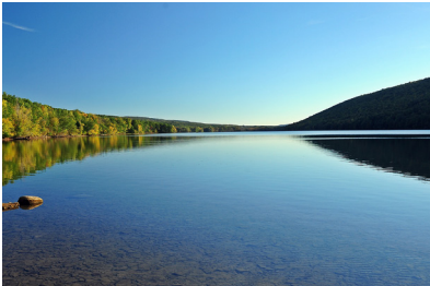
OUR PROJECTS TO SAVE LAKES, STREAMS & DRINKING WATER