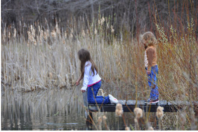
ACTIONS WE ALL MUST TAKE TO FIGHT TOXIC ALGAE