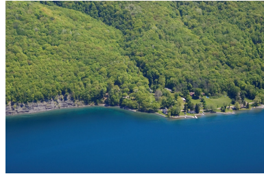
HOW IS THE FINGER LAKES LAND TRUST FIGHTING TOXIC ALGAE?