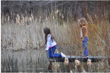
ACTIONS WE ALL MUST TAKE TO FIGHT TOXIC ALGAE