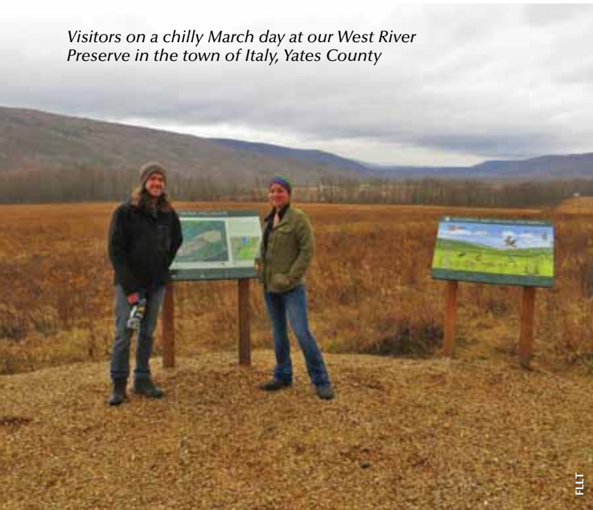
Visitors on a chilly March day at our West River Preserve in the town of Italy, Yates County