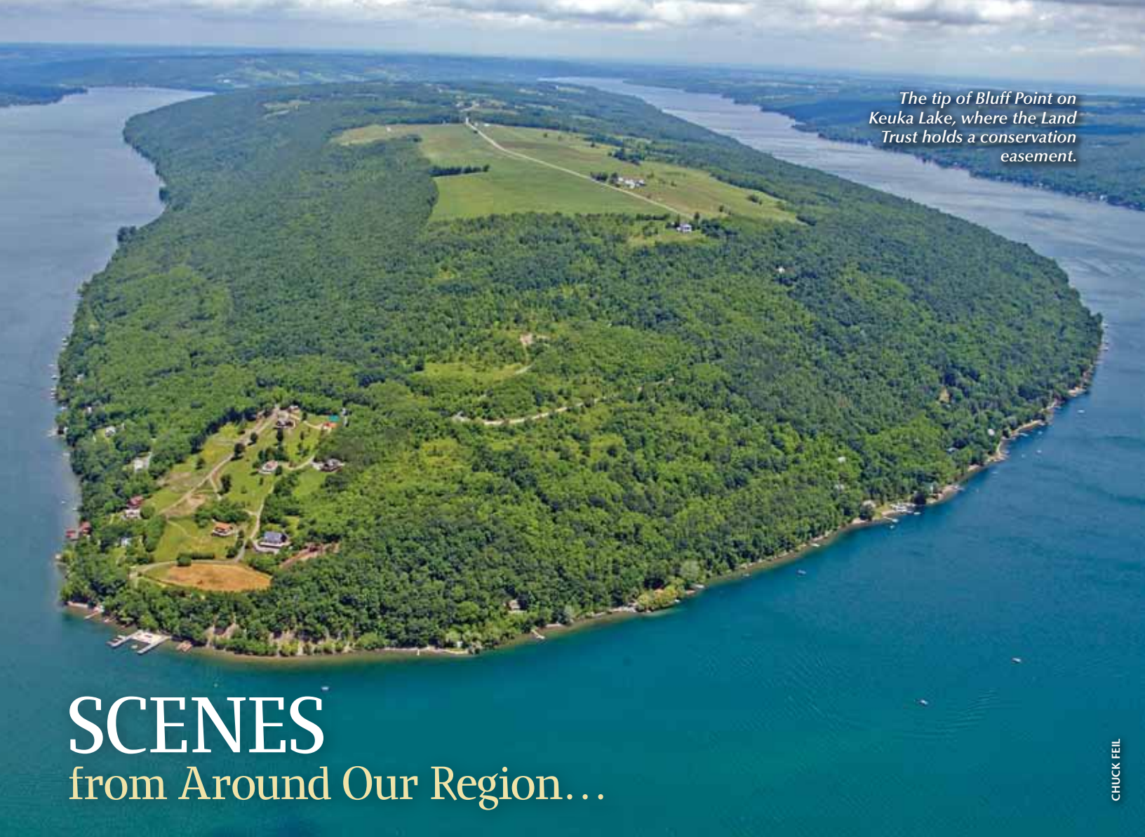
The tip of Bluff Point on Keuka Lake, where the Land Trust holds a conservation easement.