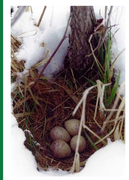
American woodcock eggs

and encouragement of certain native species is part of the process. A professional wildlife manager or forester can help in planning these operations.