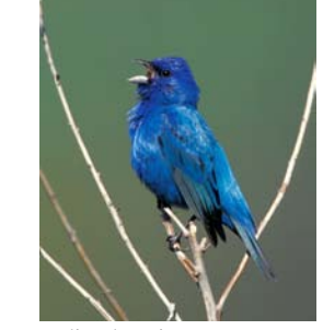
Indigo bunting Lang Elliott

course" and allow forests to mature, but in others we need to consider active maintenance of early successional habitat for the benefit of species that need that specialized habitat. When looking across the landscape, a variety of parcels with different characteristics provide the potential for improved conservation practices and value to many types of wildlife. For woodcock, in particular, it is important