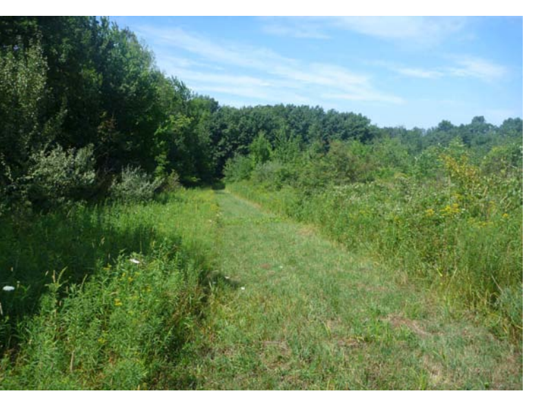
The McGuire-Keil conservation easement features a diversity of habitats which are actively managed for American woodcock and other birds and wildlife.

Managing for birds, specifically: The most important and difficult aspect is to create and maintain shrub habitat. Fields are relatively easy, you just mow periodically. Woodland is also easy, you just let it grow. But shrubland does not stay static. If you don't actively maintain it, it quickly reverts to woods.