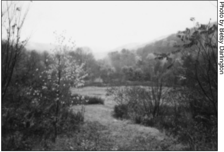
View of the forested hillsides on the King property protected by a conservation easement, adjacent to the King Preserve.

Much of the southern end of the preserve is a meadow that was probably an old farm field 35 or 40 years ago. There is a pond at the edge of this meadow (which looks like good salamander habitat) that Tom says has filled in quite a bit since he