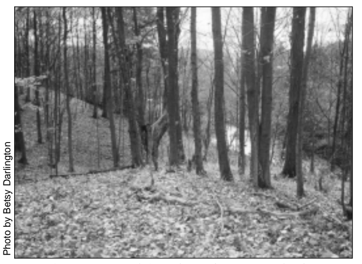
View of Sing Sing Creek from the Fridie easement land.

A lovely 47-acre tract along Sing Sing Creek in Big Flats is the setting of our first conservation easement in Chemung County.