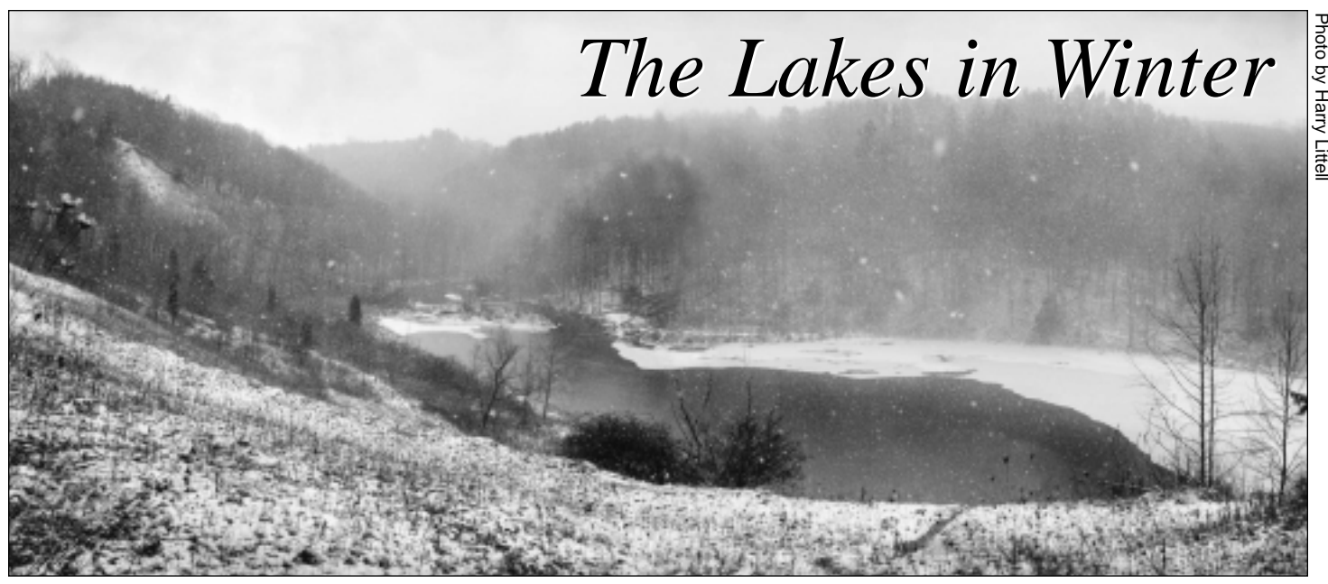
Lower reservoir, December 2, 2000

Shortly after dawn one January morning a few years ago, I stopped at the point at Taughannock Falls State Park. The temperature was fifteen below zero. The air was still, and Cayuga Lake was giving up some of its last warmth to the frigid air above it, forming a super-cooled fog. Low sunlight shone eerily on the water through Arctic-like mist that had feathered the tree branches with hoarfrost.