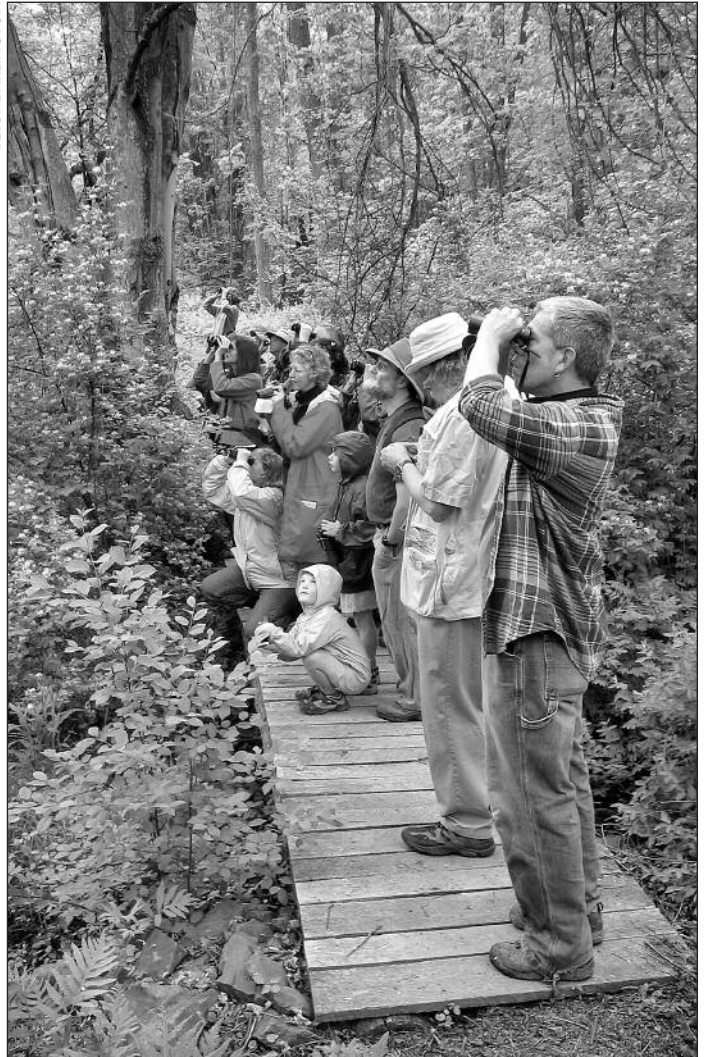
Participants during the recent inaugural Spring Bird Quest at Lindsay-Parsons Biodiversity Preserve