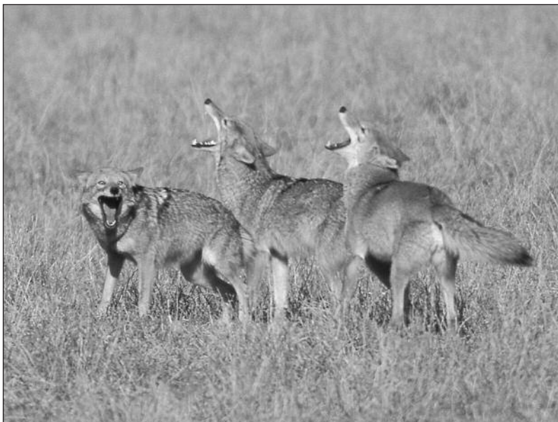
Unknown in this area just a hundred years ago, coyotes are now found in almost every corner of the continent