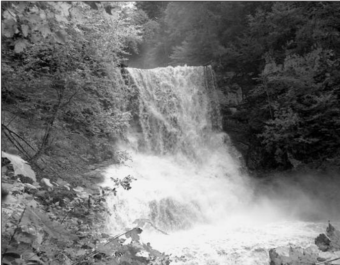
One of several stunning falls (at high flow) on the recently purchased Nemec property (see article on page 1)