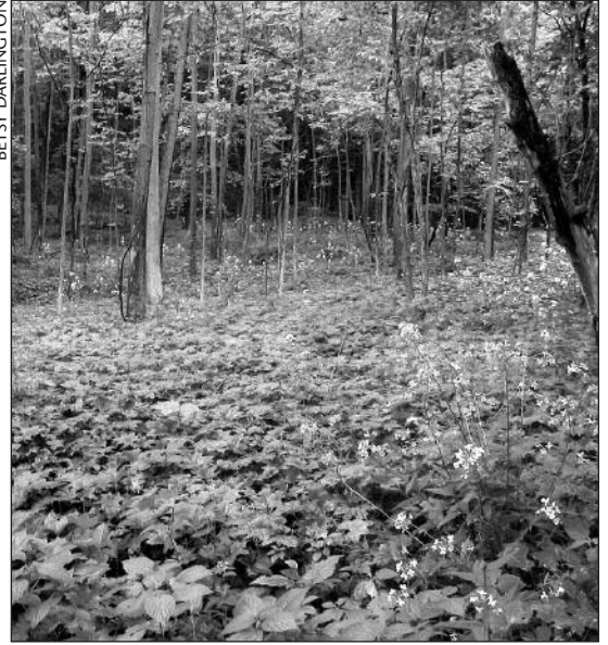
Flood plain woods along the trail at the Sweedler Preserve at Lick Brook

“There is a way that nature speaks, that land speaks. Most of the time we are simply not patient enough, quiet enough, to pay attention to the story.”