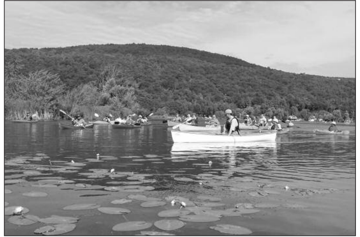
At ten years, the Land Trust’s Talks and Treks series has become an institution. Pictured above are participants enjoying the 2004 Hi Tor Paddle Adventure on Canandaigua Lake

Last year, over 500 Finger Lakes residents and visitors attended the series. A walk through Grimes Glen in Ontario