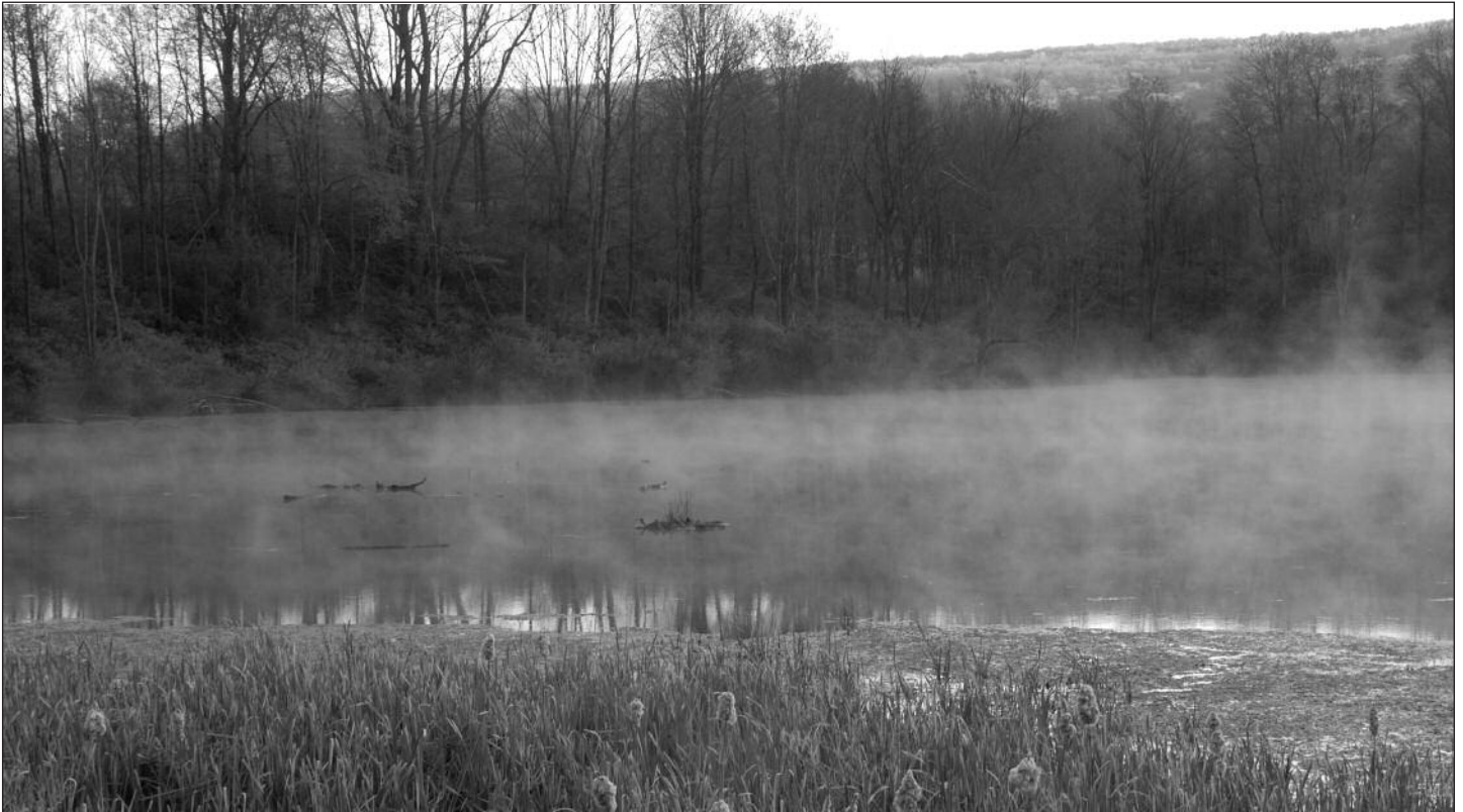
Early morning mist at Lindsay-Parsons Biodiversity Preserve