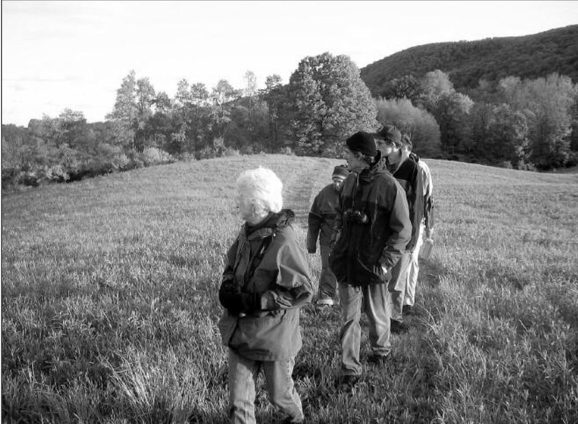
Hikers enjoying the “Sunset Symphony” field trip at Lindsay-Parsons Biodiversity Preserve, part of this year’s Talks and Treks series