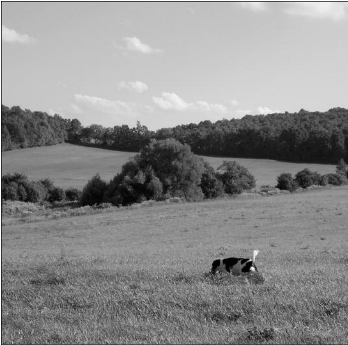
The 200-acre Green farm, owned by fourth generation farmer Don Green, is the Land Trust's 50th conservation easement and its sixth in Ontario County