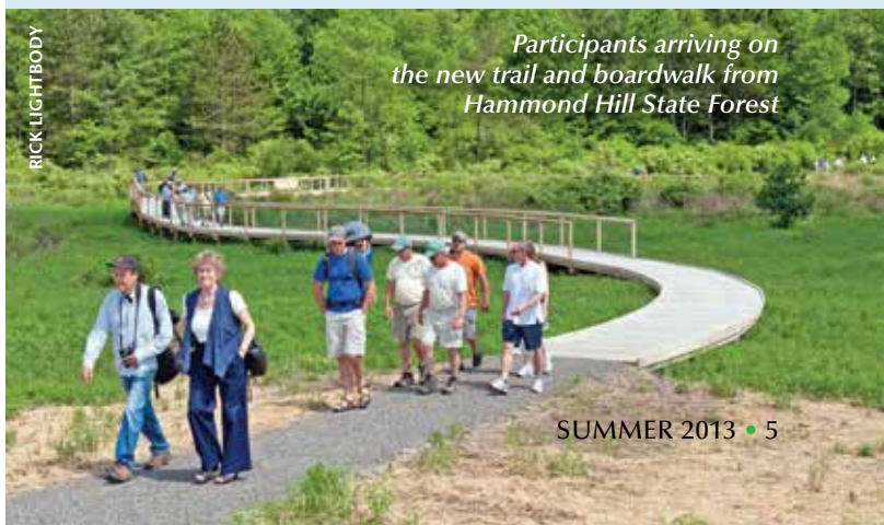
Participants arriving on the new trail and boardwalk from Hammond Hill State Forest